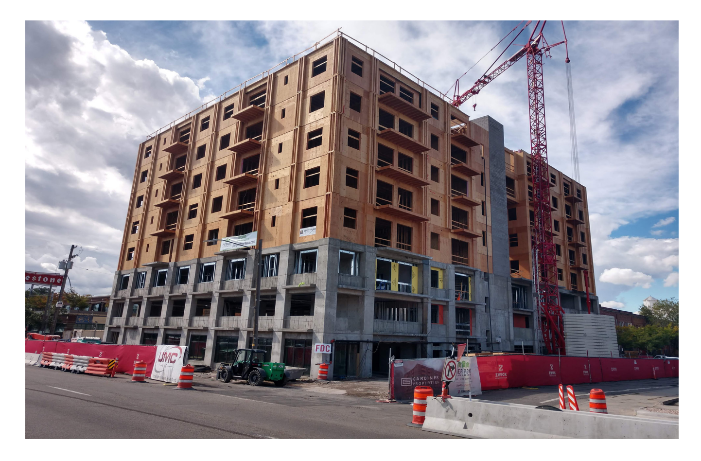
Figure 2. Structures like this 5-over-3 podium building near Salt Lake City, Utah, can use wood harvested from the WUI to provide dwelling units in increasingly densified urban corridors while helping to reduce standing tree densities in nearby forests. This FRTW could also be used in structures built in the WUI, too.

who are empowered to act through education may help reduce the severity of any subsequent impacts from those WUI-related pressures releasing.